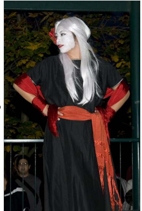
The Lady of the Night led the opening ceremony for Día de los Muertos 2008 with leaves blowing in the wind on a crisp autumn evening.

If you are interested in participating in the event next year, please call 206.957.4640.