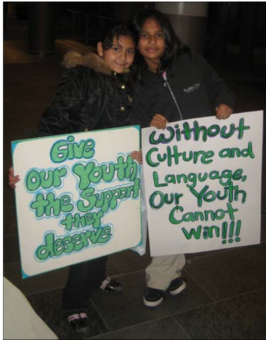
Students from El Centro's After School Program support youth as they testify to City Council about how the Seattle Team for Youth program helps youth stay in school and away from gang activity.

El Centro de la Raza participants, supporters, friends and staff testified at the Seattle City Council hearings on October 8th and 27th. Gracias to all those who testified, called in testimony and emailed, faxed or wrote comments to the Council on behalf of our youth. You helped make sure the voices of our youth were heard!