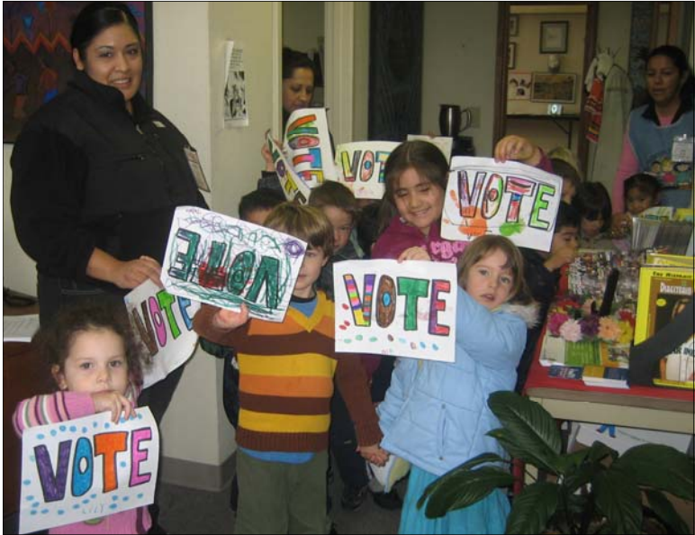
The children of José Martí remind everyone in the El Centro de la Raza building to vote during election day!

Following the historical 2008 election, El Centro de la Raza staff reflect and share their sentiments below: