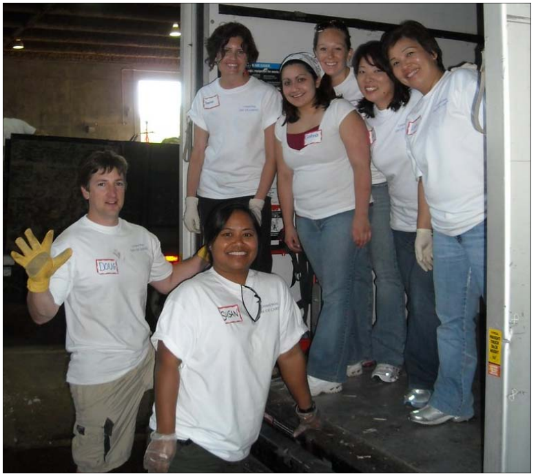
Nordstrom volunteers worked on four different projects at El Centro de la Raza during the United Way Day of Caring.

If you would like to volunteer for the United Way Day of Caring next year, please contact our Volunteer Coordinator at volunteer@elcentrodelaraza.org or (206) 957-4602.