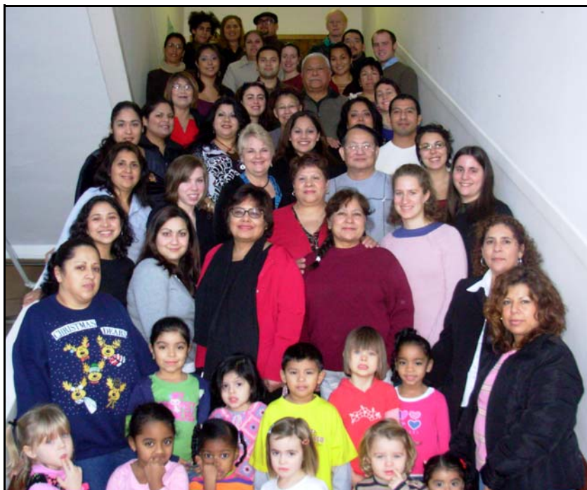
El Centro de la Raza staff and children.