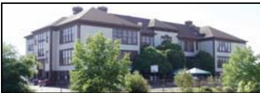
El Centro de la Raza The Center for the People of All Races