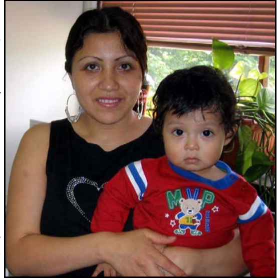
A family in our Homeless Assistance program.

▪ Low-Income Housing ▪ Commercial Space ▪ Building Uses & Tenants ▪ Volunteerism ▪ Global Relations