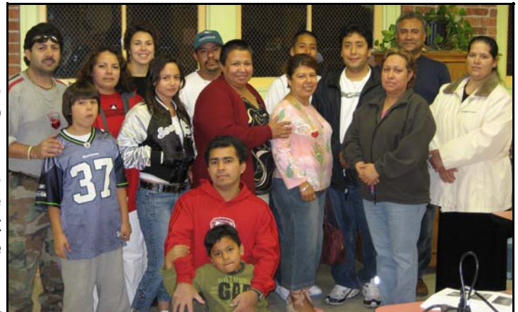
Families and staff at a Parent Involvement meeting, which bilingually educates families on education issues.

The Parent Involvement in Education Program provides culturally and linguistically appropriate services to engage parents in the education system, allowing them to support their children's academic success. Issues addressed include school entry, transitions, graduation and monthly workshops on various education topics. Case managers also work with parents of students retaking the Washington Assessment of Student Learning (WASL) exam to provide tools for success. This program is integrated with our Seattle Team for Youth Program that reaches out to students who are at risk of dropping out of school or who have dropped out of school.