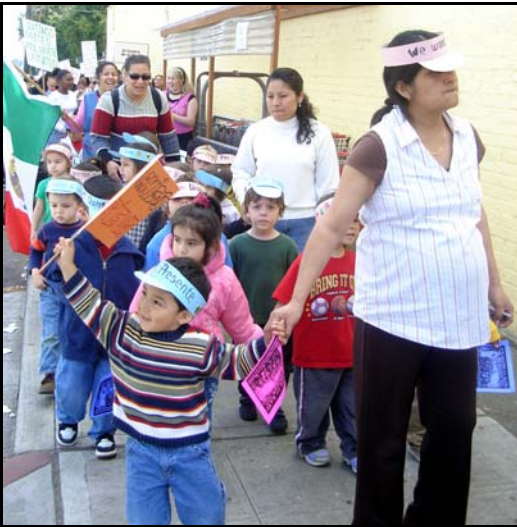
Children and elders at El Centro march along Beacon Avenue in support of fair immigration rights in April 2006.

▪ José Martí Child Development Center ▪ Luis Alfonso Velasquez Flores After School Program ▪ Hope for Youth Poetry & Civil Rights History Classes ▪ Seattle Team for Youth ▪ Infant Mortality Prevention ▪ Next Generation ▪ Parent Involvement Program