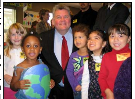
José Martí children at the Early Learning Network Press Conference with Mayor Greg Nickels.

for the Early Childhood Education and Assistance Program (ECEAP), which doubled our enrollment in this program. A recent Public Health SERF exam identified 8 out of 30 children that were in the top 50% of the study as José Martí students. We've had five teachers finish their AA Degree, paid for by the Early Learning Network and SERF program, and five teachers are enrolled in Bachelor's Degree programs.