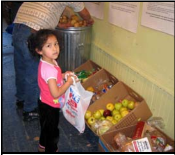
A young girl in El Centro's Food Bank.

Human Services: Seeking to address immediate aspects of human suffering such as hunger, healthcare and homelessness, El Centro provides diverse human services from our Frances Martinez Community Service Center.