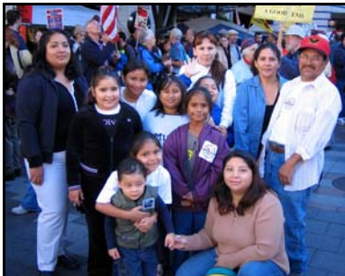
Peace rally at Westlake Center.

▪ Low-Income Housing ▪ Commercial Space ▪ Building Uses & Tenants ▪ Volunteerism ▪ Global Relations