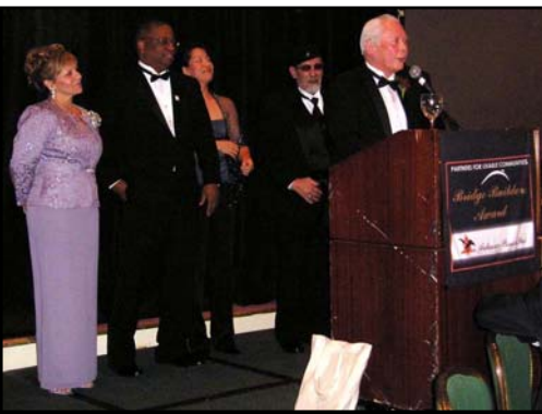
On stage at the Bridge Builders Awards.

This coalition of community groups includes educators, parents, youth and concerned citizens was organized to address the needs of Latinos in the public school system in order to make our educational institutions more successful for all students, including Latino students. This coalition coordinates with Seattle Public Schools and El Centro de la Raza acts as the fiscal agent. Campaña Quetzal is also responsible for holding Seattle's first ever Latino Education Summit .