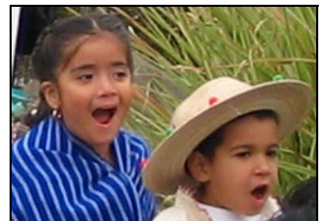
José Martí children singing peace songs celebrating the work of Cesar Chavez.

—Washington State Housing Finance Commission (October 2005)