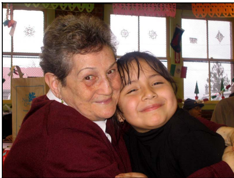
A participant in our Senior Nutrition and Wellness Program with her pen pal in our Luis Alfonso Velasquez Flores After School Program. (See next page.)

Amid the shameless corruption of the enemies of progress and justice, El Centro de la Raza has emanated the love and unity it takes to turn tragedy