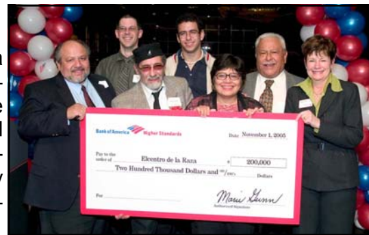
El Centro receives the $200,000 check from Bank of America!

A very special 'Mil Gracias' to Bank of America for honoring El Centro de la Raza with the 2005 Neighborhood Builders Award of $200,000 , to be distributed over a two-year period. The initiative aims to help revitalize Seattle communities by identifying and addressing community priorities, offering fiscal support and building community leaders. The funds will be used to further develop our Homeownership Program and other initiatives. This was a highly competitive process and we appreciate the generosity and community involvement of Bank of America!