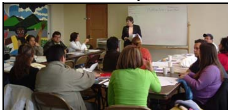
Financial Literacy Seminar