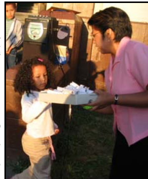
A José Martí graduate from the 2005 graduation ceremony at El Centro de la Raza.

To enroll your child or for more information, please call 206.957.4619.